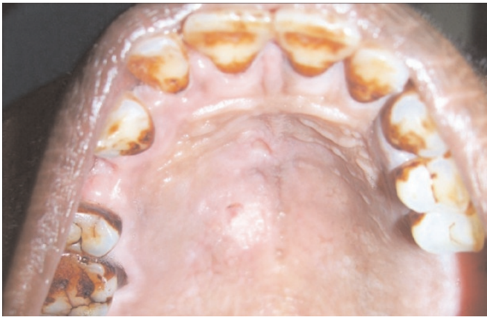
Figure.2:Tuberculous ulcer affecting palatal mucosa