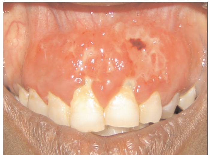
Figure.1: Tubercular gingival lesion

Tubercular gingival lesions (Figure.1) may present as exuberant and granulating or as mucosal erosions. Sometimes these lesions may be seen simultaneously with marginal periodontitis [15]. Chronic desquamative gingivitis is associated with chronic infections affecting the gingiva, the most common being tuberculosis. Case reports of gingival tuberculosis appearing as diffuse gingival enlargement [16], instead of the usual manifestation as an ulcer or localized granular mass, have also been documented in the literature.